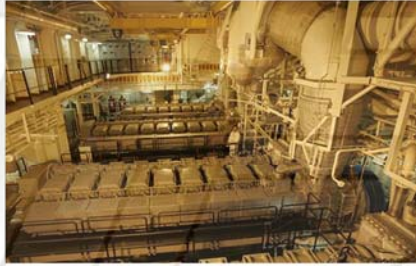
GAS TURBINE / DIESEL EXHAUST