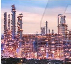
OIL / GAS