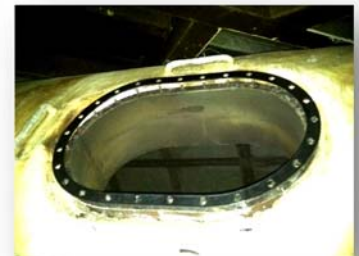
MAIN ENGINE EXHAUST MANWAYS