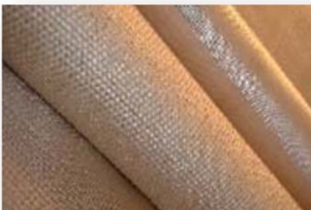
WOVEN FIBERGLASS CLOTH WIRE REINFORCED HH-P-0031 TY 1, CL 1