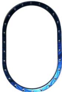
GRAFOIL with SS INSERT TEMPERATURE - 850° F in ATMOSPHERE TEMPERATURE - 4000° F in STEAM

GRAFOIL is an acceptable material replacement for manhole cover gasket (HH-P-31 Type1 reference NSTM 078 Table 8-2) IAW NSTM 078 paragraph 078-8.2.3.