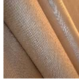
FIBERGLASS CLOTH HH-P-31 TYPE 1