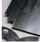
GRAFOIL w/ SS INSERT