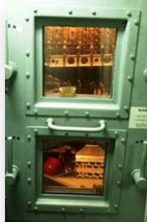
MODULE DOOR WINDOW SEAL KIT #13134