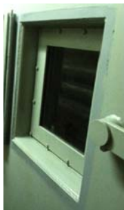
INLET PLENUM INSPECTION WINDOW KIT #149345