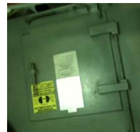
TOP HATCH SEAL KIT #20234