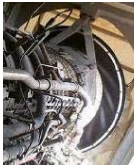
GAS TURBINE BARRIER WALL GASKET PN: CAP-3471-1