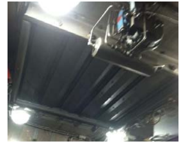
INTAKE VENT DAMPER SEAL KIT #AC3313-42