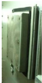
FORWARD WALL COVER KIT #30667