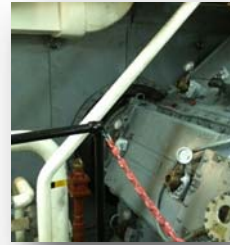
REAR ACCESS PANEL SEAL (BARN DOOR) KIT #10763