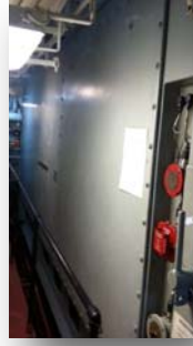
SIDE ACCESS PANEL SEAL KIT #12642