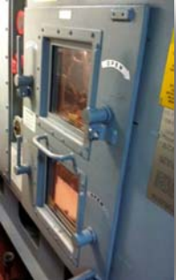
MODULE DOOR SEAL KIT #51893